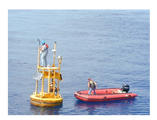
TABS 2.25. being repaired after a ship tied up to it breaking a solar panel and wind sensor