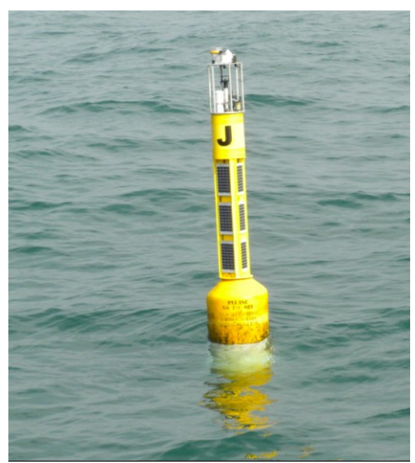
TABS II buoy with meteorological station on top