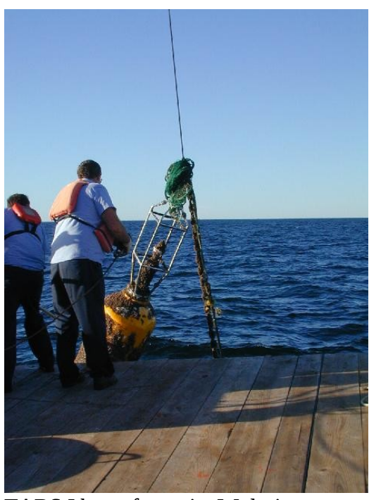
TABS I buoy from site W during recovery with fishing net wrapped around mooring