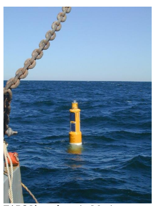
TABS I buoy from site W prior to recovery 15 NMI off location.

These buoys and the information they provide are a tremendous resource for the people of Texas. They help protect our environment and provide useful information to fishermen, boaters and the rest of the marine community. Please help protect our marine resources.